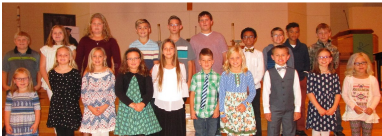
These students celebrated First Communion on Sunday, October 15.